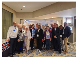
District 6900-PDGs, DG, DGE, DGN & Emerging leaders.